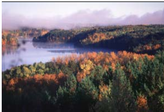
A spectacular fall landscape near Biwabik in northern Minnesota.

This year, the Minnesota Department of Natural Resources will host the Fall 2004 ELRC Conference to be held at the Giants Ridge Golf and Ski Resort in Biwabik, Minnesota, from October 3-7, 2004. Biwabik is located 55 miles outside of Duluth in Minnesota's great North Woods.