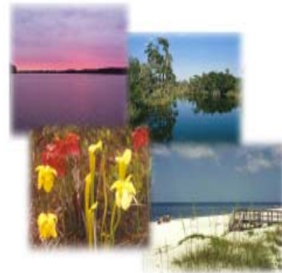
A taste of Alabama's beautiful scenery.

This year's four-day conference brings together land management leaders from across the United States to showcase the achievements of land use, resources, and management in Alabama, as well as provide a forum of information and idea exchange. During the conference, guests can expect to be on the run with excursions throughout the coastal area of Alabama.