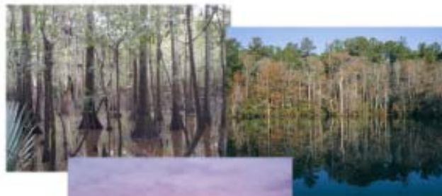
Scenery in Alabama