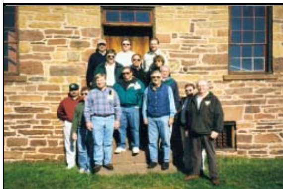
During the fall 1999 meeting, ELRC members took a break to visit Manassas Battlefield in Virginia.

* September 24-28, 2000, Nashville & Memphis, Tennessee.