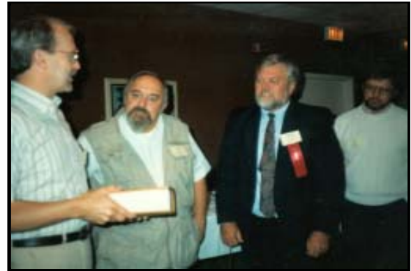
Do you recognize these folks?