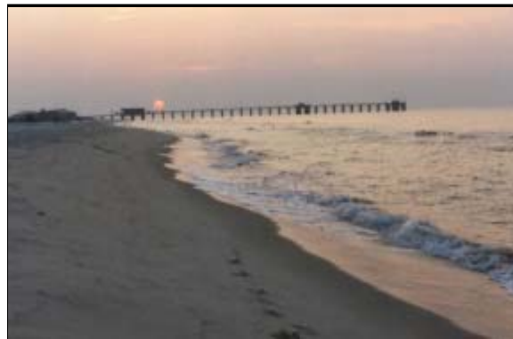
Pier at Point Clear, Alabama

From October 5-9, 2003, the Eastern Lands and Resources Council (ELRC) will hold its fall 2003 meeting in the State of Alabama. You are invited to come and enjoy some "Old Southern Hospitality" in Point Clear, Alabama, at The Marriott Grand Hotel Resort, Gulf Club & Spa, located on the relaxing and historic waters of Mobile Bay.