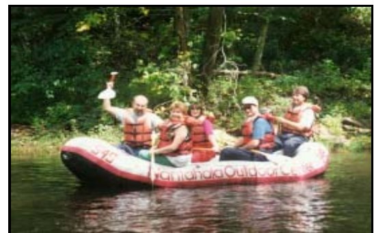
ELRC members enjoyed a day of rafting on the river in Gatlinburg, Tennessee, during the fall meeting in 1994.

* October 24-28, 1999, Springfield, Virginia.